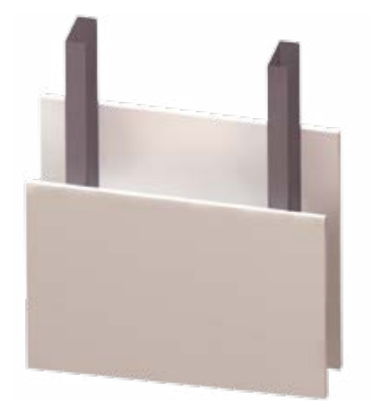
Partition Type 1 38 STC 3 5%" Stud